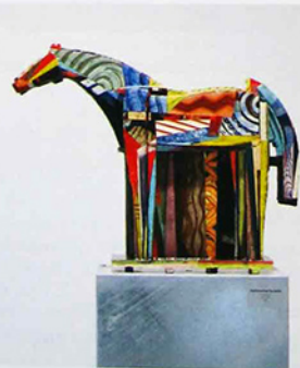
Shin Sang Ho, Minhwa Horse , 2010, glazed ceramic, 70 x 18 x 25 cm.

Avital Sheffer was born in 1954 in Israel and moved to Australia in 1990. Sheffer's